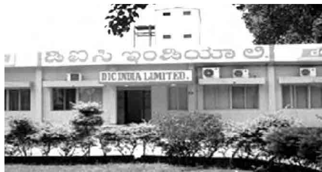
Ahmedabad Plant – Manufacturing facility for News Black