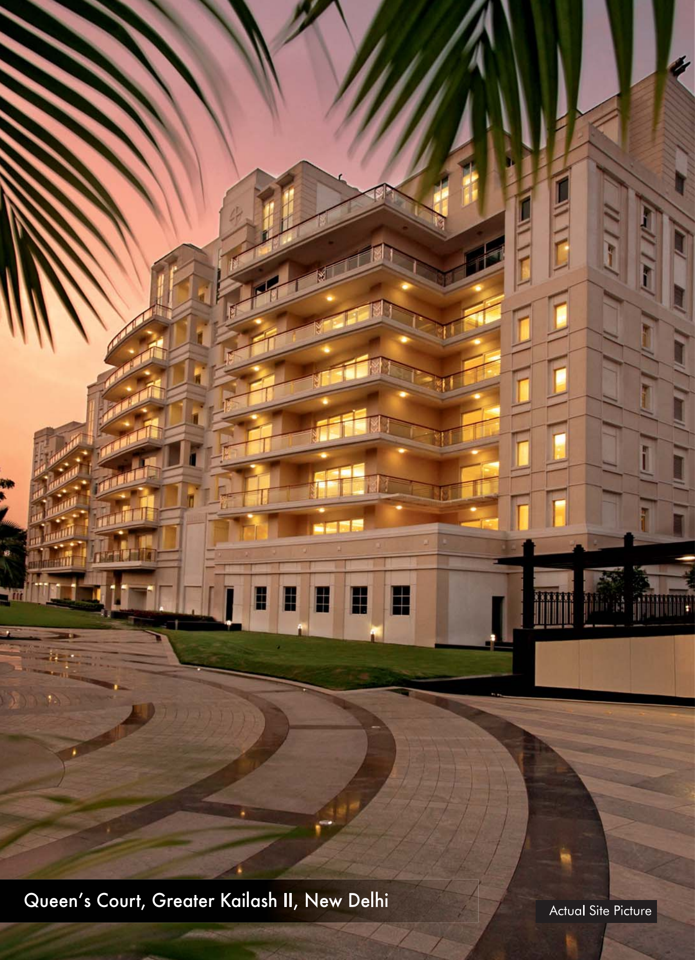
Queen's Court, Greater Kailash II, New Delhi