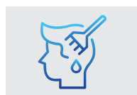
Dyes and Pigments