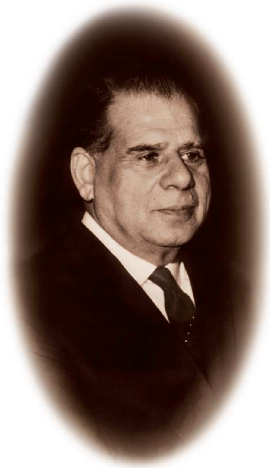
The Late Rai Bahadur M.S. Oberoi Founder of The Oberoi Group 1898-2002