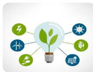
Energy Power Saver