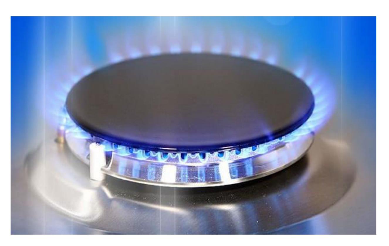
YOUR FUEL, OUR COMMITMENT