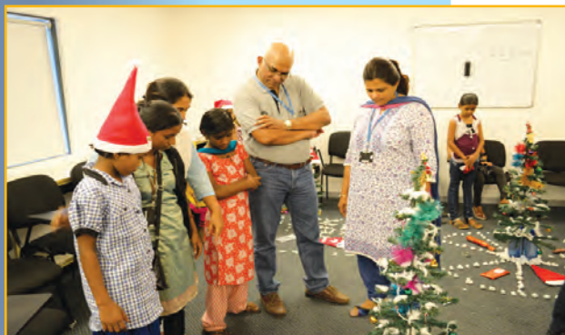
Children Activities Arranged at eClerx