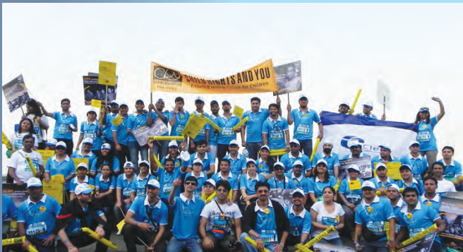
Mumbai Marathon 2013

While eClerx has been participating in philanthropic activities since 2006, we formalised our corporate citizenship initiative with eClerx Cares in 2009. The eClerx Cares council is responsible for championing all CSR initiatives of the Company. We continue to earmark a corpus every year on eClerx Cares activities. The program undertakes initiatives in the area of education by being participants of progress and ensuring effective support to bring visible improvements in the lives of the underprivileged. Our partner NGOs are selected for their projects on child rights and education which is one cause that resonates broadly within the eClerx family.