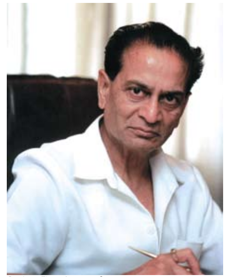
Society First: A man of empowerment