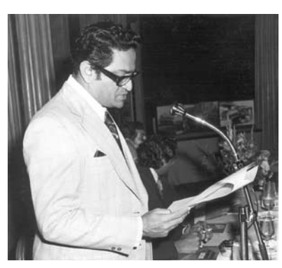
At conference celebrating India's largest MHE contract then Neyveli Lignite Corp. in 1975