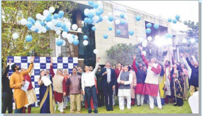
SAP ( Project 'Polaris') – "Go- Live" event