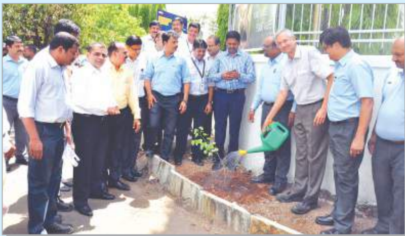
Celebrating the 'World Environment Day' with neighboring Companies on 05 June 2017