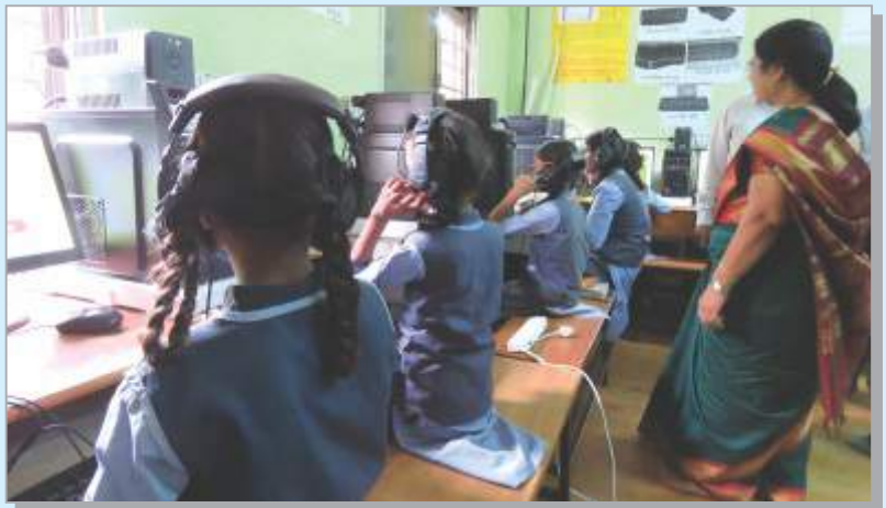
E Learning Facilitated At Z. P. Schools Under CSR Activity