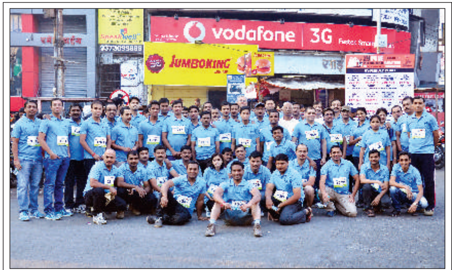
Enthusiasm at its best: Participation in Pune International Marathon 2014 'Run for Peace'