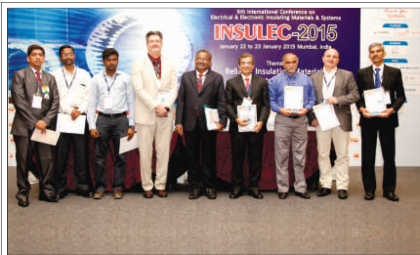
Active Participation in INSULEC 2015, an International Conference organized by IEEMA. Theme: Reliable Insulation Materials + Systems Vision 2020