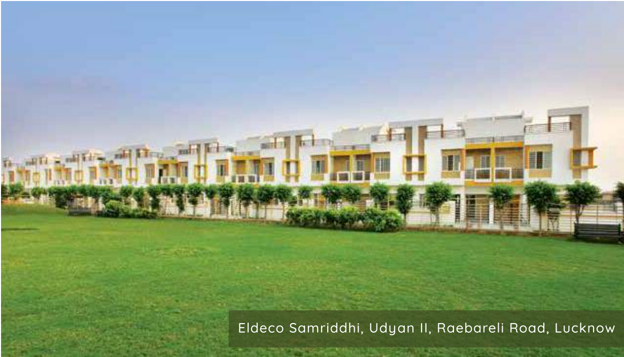
Eldeco Samriddhi, Udyan II, Raebareli Road, Lucknow