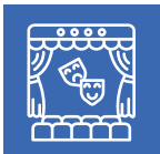
Indoor & Outdoor Entertainment

Several Eldeco properties are equipped with outdoor and indoor entertainment areas including clubs, pool, gardens, kids' area, gym and more. Few projects also provide in-house departmental stores for the convenience of residents.