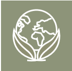
Eco Friendly Designs