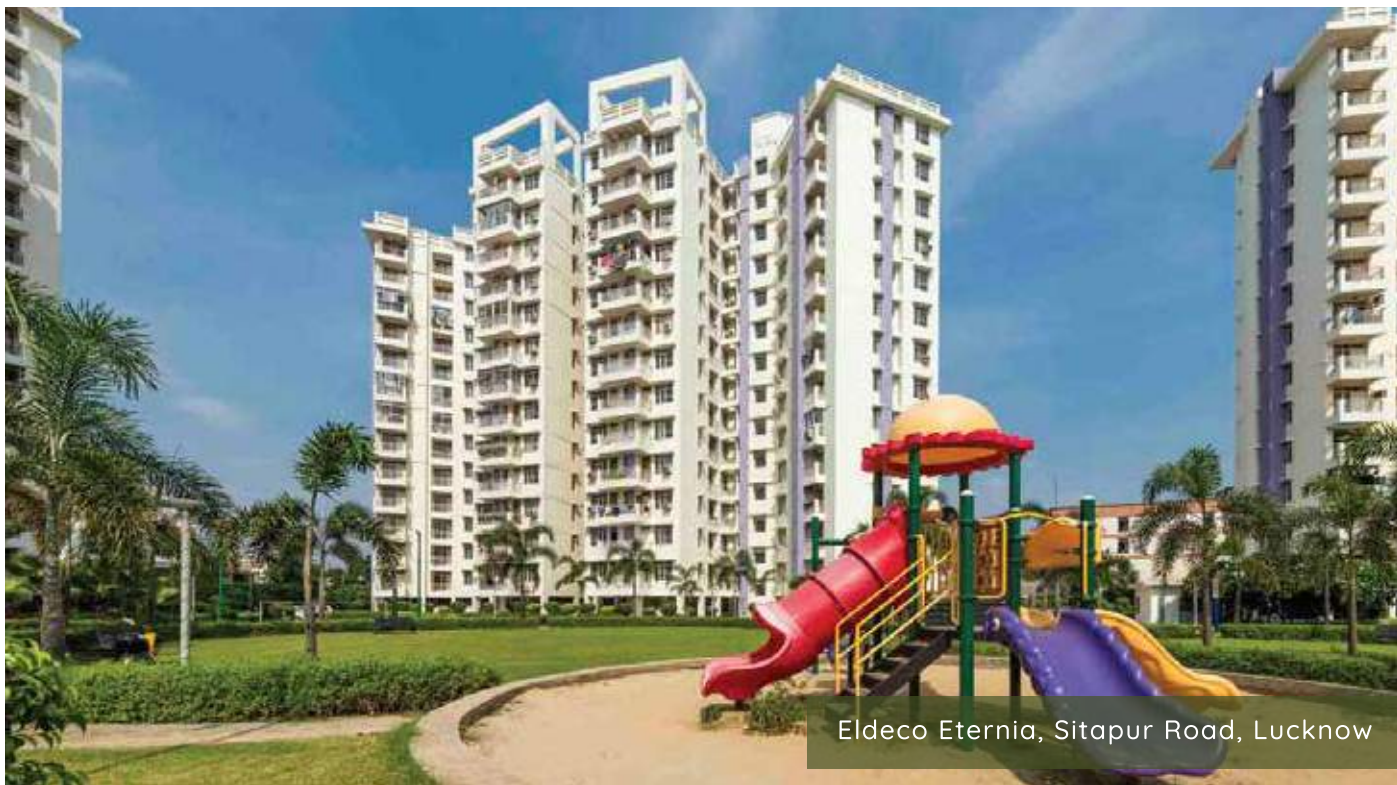
Eldeco Eternia, Sitapur Road, Lucknow

for our residents. Our innovative thought processes paired with unparalleled breadth of experience have allowed us to set new standards of excellence.