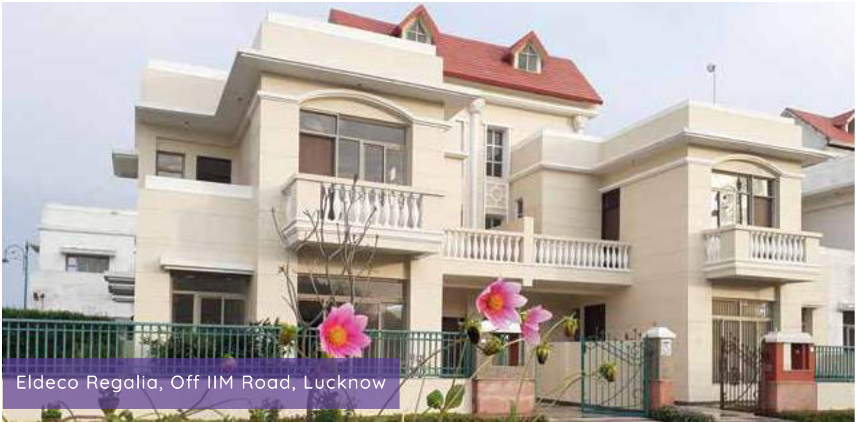
Eldeco Regalia, Off IIM Road, Lucknow