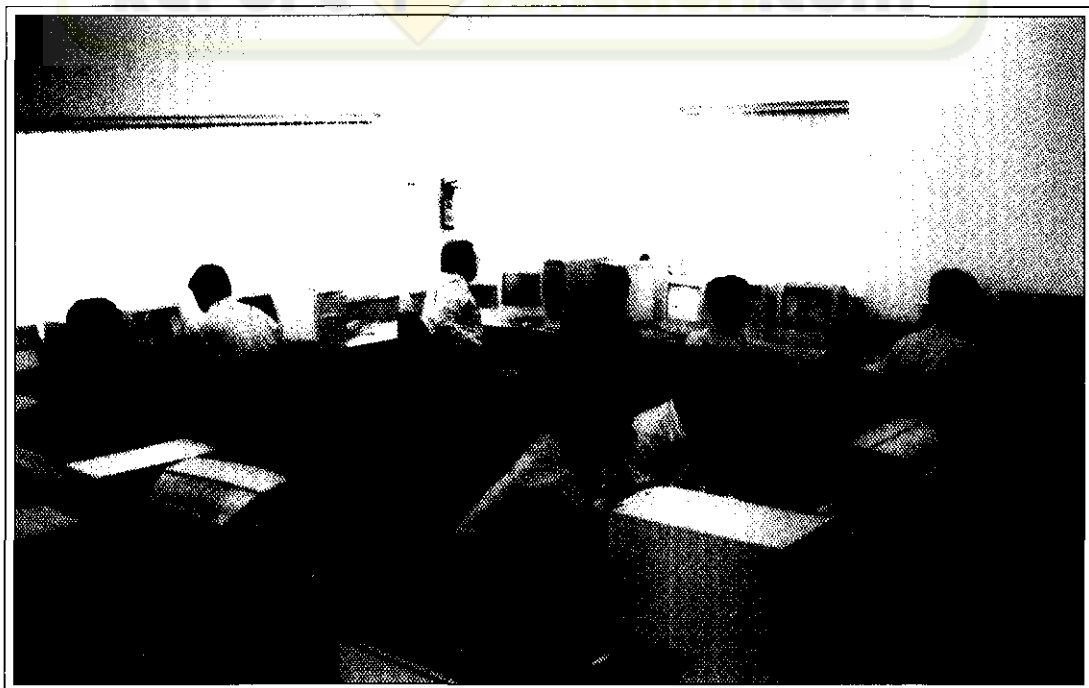
A section in the Software Development Centre