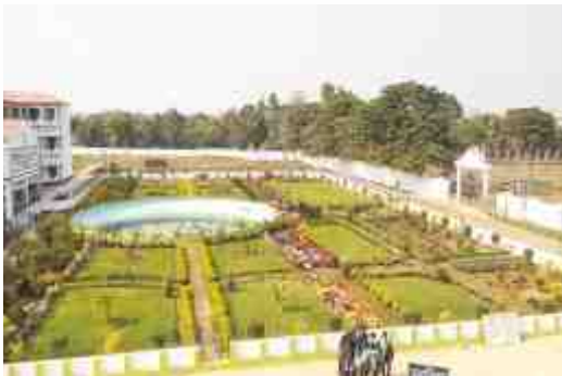
Infrastructural development at Remuna college and local schools