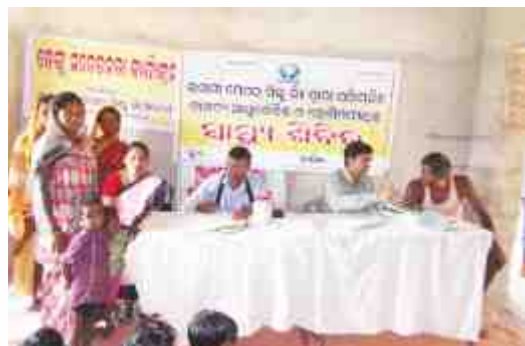
Health Check-up Camp