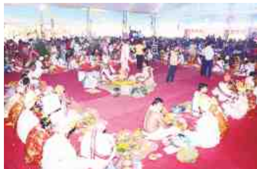
Organising mass marriage