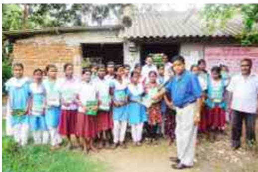
Exercise notebook distribution in local schools