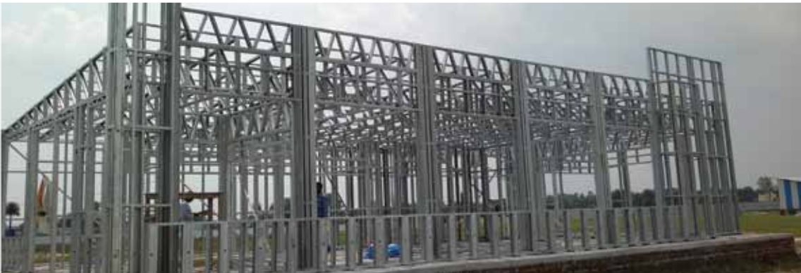
Smart Steel Buildings