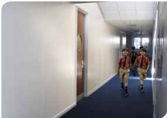
Solid Wall Panels