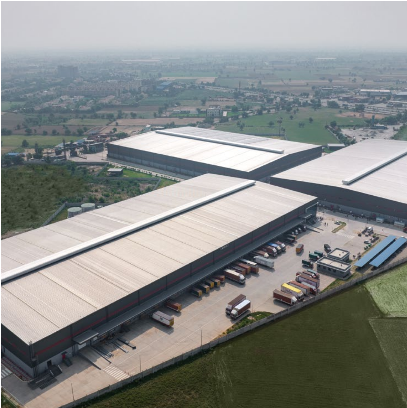
Pragati One, Rewari

“ Everest provided a tailor made solution focused on process requirements of the customer. Moreover, we overcame the challenge of the location being far from our manufacturing unit. ”