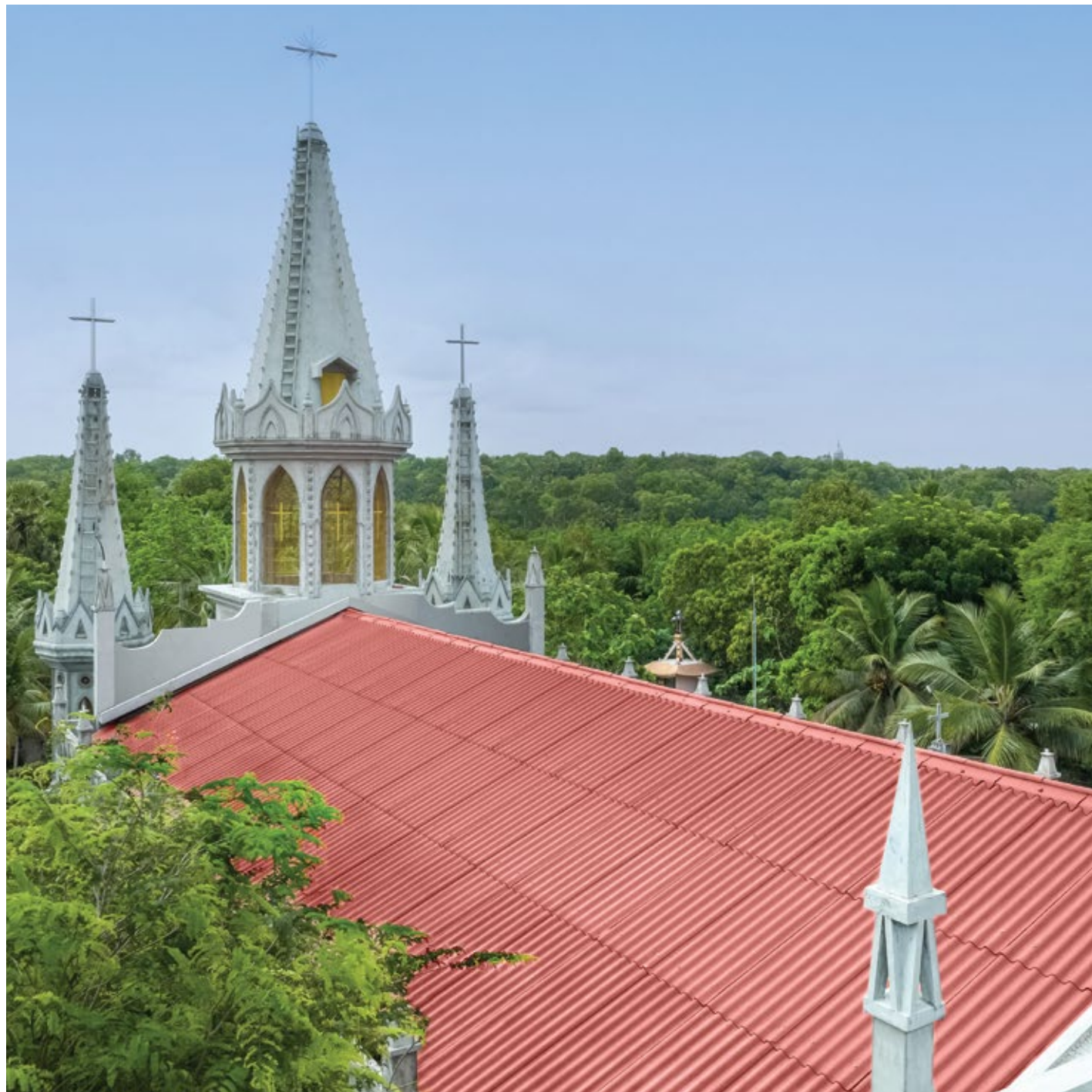
St. Mount Carmel Church, Thiruvananthapuram

“ Everest’s high-performance, asbestos-free, Hi-Tech roofing sheets were the first choice for the St. Mount Carmel Church in Thiruvananthapuram. The beautiful terracotta red colour roof retains the cultural flavour of the region and stands out against the lush green surroundings. ”