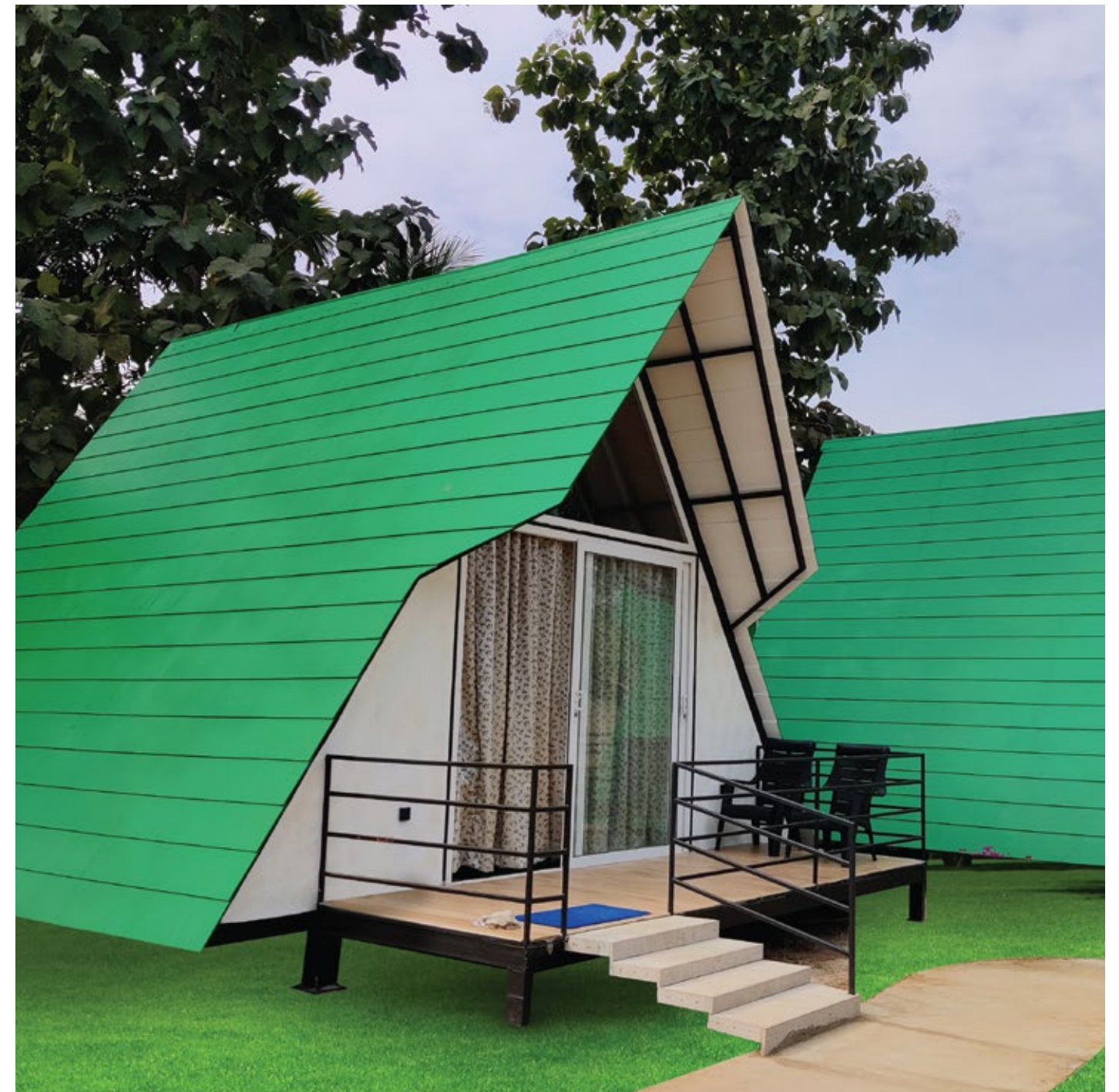
Wildernest Resort, Kaziranga

“ The Kuala Lumpur based firm Design Wilkes had an aim to create Hotel W, Goa’s melange of the rustic and the dramatic, which made it the perfect project to use Artewood that combines high-end aesthetics with environment-friendly advantages, to create a splendid experience of beauty and functionality. ”