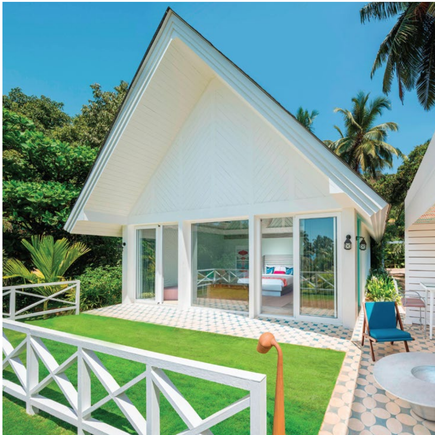
W Hotel, Goa

“ The Kuala Lumpur based firm Design Wilkes had an aim to create Hotel W, Goa’s melange of the rustic and the dramatic, which made it the perfect project to use Artewood that combines high-end aesthetics with environment-friendly advantages, to create a splendid experience of beauty and functionality. ”