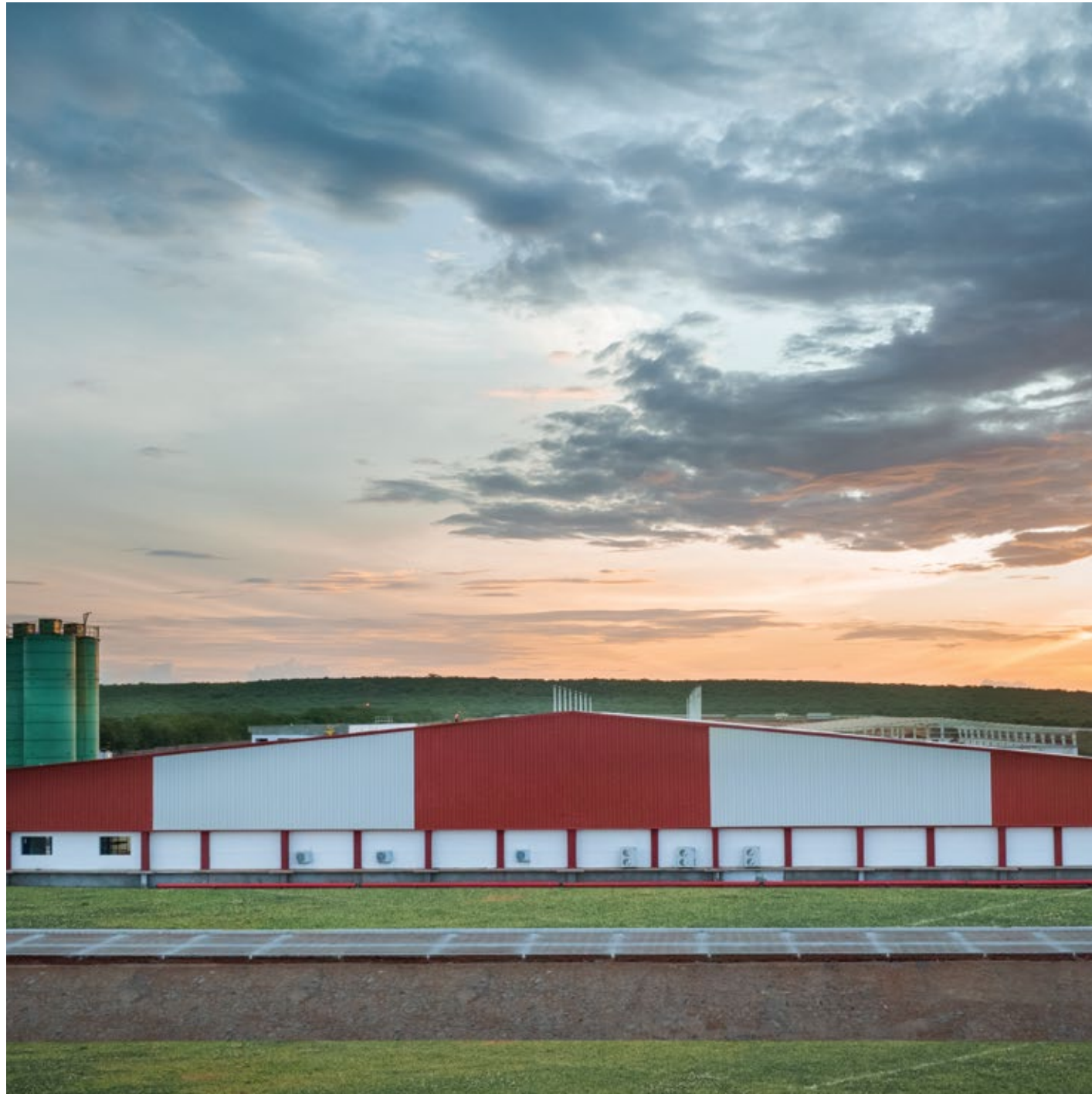
Britannia Industries, Tirunelveli

“ Everest provided a tailor made solution focused on process requirements of the customer. Moreover, we overcame the challenge of the location being far from our manufacturing unit. ”