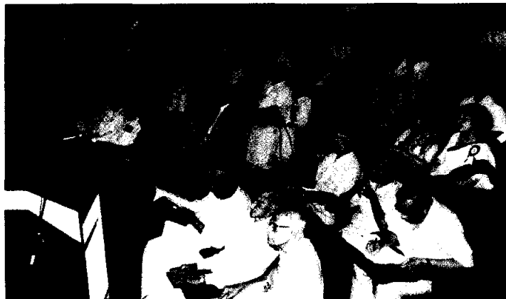
Shareholders at Exide's 53rd Annual General Meeting at G.D. Birla Sabhaghar, Kolkata

The Original Equipment segment in the automotive battery sector performed better than the automotive industry itself, where vehicle production showed a continuous downtrend. In fact, other than motorcycles and light commercial vehicles, all other segments performed below par. Against this backdrop, it is indeed creditable that your company continued to dominate this segment