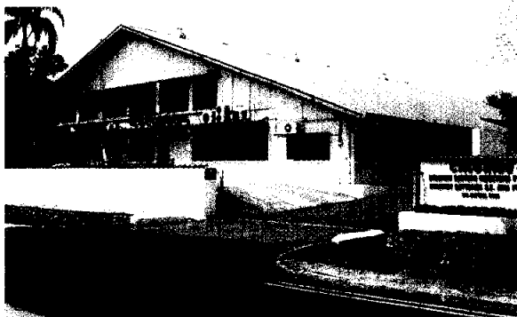
CBSEA at Singapore

part of the Directors' Report for the financial year ended 31 March 2001, are attached hereto.