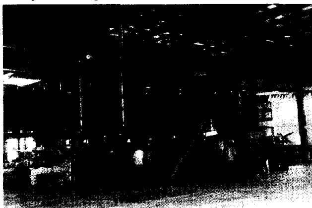
A view of the Automotive Plant at Hosur

Your company also desires to place on record its appreciation of the support and co-operation of the distributors, C&F agents, dealers and all others associated as partners in progress. Your company would continue its endeavours to build and