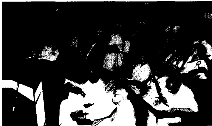
Shareholders at Exide's 53rd Annual General Meeting at G.D. Birla Sabhaghar, Kolkata

The Original Equipment segment in the automotive battery sector performed better than the automotive industry itself, where vehicle production showed a continuous downtrend. In fact, other than motorcycles and light commercial vehicles, all other segments performed below par. Against this backdrop, it is indeed creditable that your company continued to dominate this segment