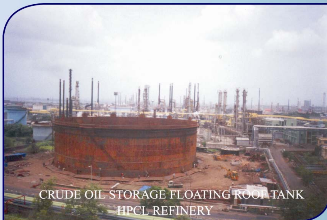
CRUDE OIL STORAGE FLOATING ROOF TANK HPCL REFINERY