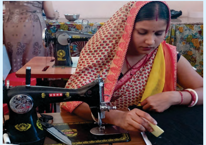
Counselling Sessions by Logistics sector skill council to discuss about job opportunities available for women in Logistics sector

More than 2585 women have been trained through our training programs. They have been certified after qualifying in the exams. Have also given them procurement orders for hand- made bags for our customers during Auto Expo.