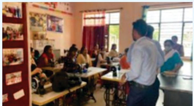
Workshop on Sewing Machine maintenance