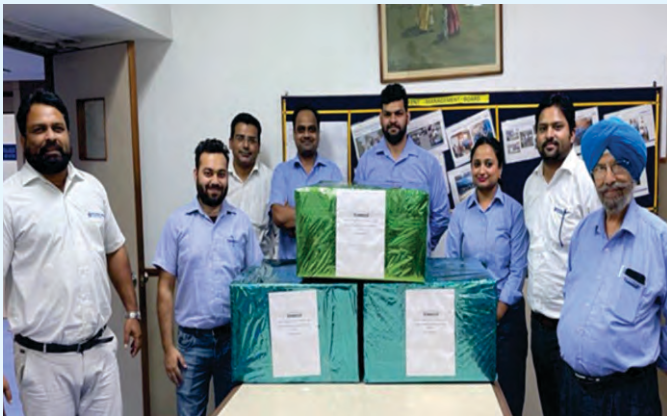
Patiala Team with the commodities to be distributed in collaboration with Goonj.

Campaigning Locations were Gurgaon, Bhiwadi, Parwanoo, and Patiala.