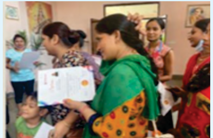
Certificate distribution to the successful candidates