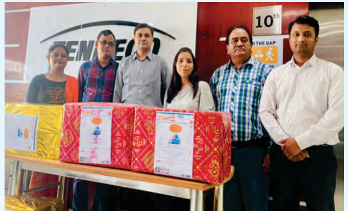
Gurgaon : As a Socially responsible organisation, Tenneco is committed for giving back to society in terms of uplifting and empowering the needy and underprivileged sections of society. As a part of CSR