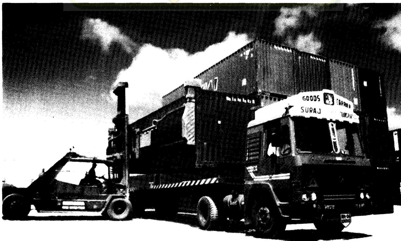
FORBES CONTAINER YARD AT NHAVA SHEVA - FORBES PATVOLK SHIPPING DIVISION