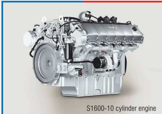
S1600-10 cylinder engine