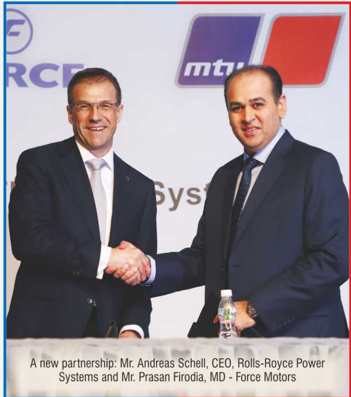
A new partnership: Mr. Andreas Schell, CEO, Rolls-Royce Power Systems and Mr. Prasan Firodia, MD - Force Motors

Force Motors signed a Joint Venture Agreement with Rolls-Royce Power Systems in Mumbai on 20th March 2018 at a media press conference. The JV will produce MTU's renowned 10 and 12 cylinder, Series 1600 engines with power output from 545 to 1050 HP. The Series 1600 engines are particularly suitable for power generation and rail underfloor applications.