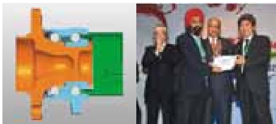
Gen3 Wheel Bearing

It was with this approach that we pioneered the development of First Generation Wheel Bearings for Indian cars some two decades ago. And it is with the same passion that our engineers are now working towards bringing advanced 3 rd Generation Wheel bearings in India.