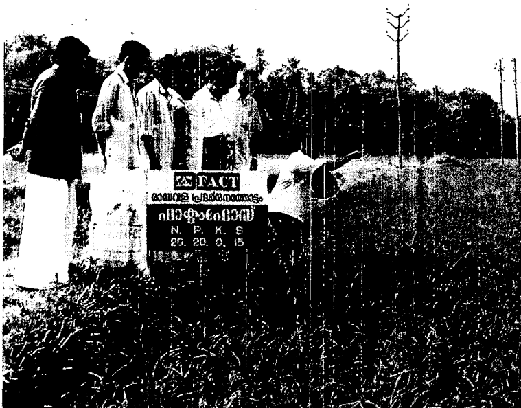
Paddy Demonstration Plot-Kuttanadu

operations of MOP. Likewise, sale of Bio-Fertilisers and Bio-Pesticides was also continued. Sale of Bio-Fertilisers almost trebled in Tamil Nadu and Karnataka. The volume of sales this year was 46.27 tonnes compared to 18.2 tonnes during the previous year. Pesticides sales also showed considerable growth. The turnover of Pesticides during the current year was Rs. 4.77 crores compared to 2.48 crores during the year 1995-96.