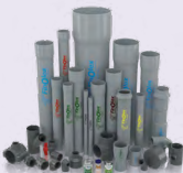
Agricultural PVC-U Pipes & Fittings