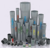
Agricultural PVC-U Pipes & Fittings