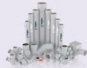
SWR Pipes & Fittings