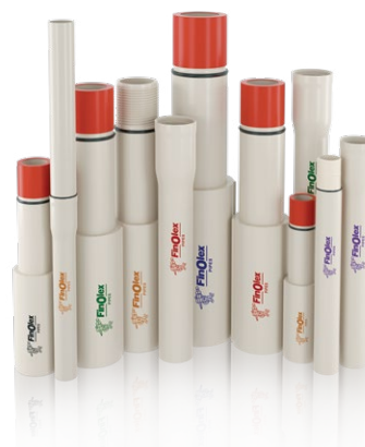
► Column Pipes