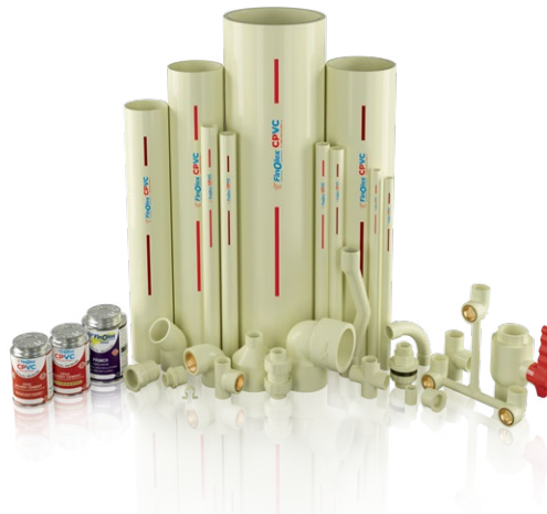
▶ CPVC Pipes and Fittings