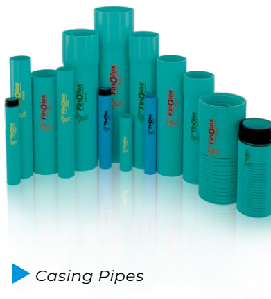
► Casing Pipes