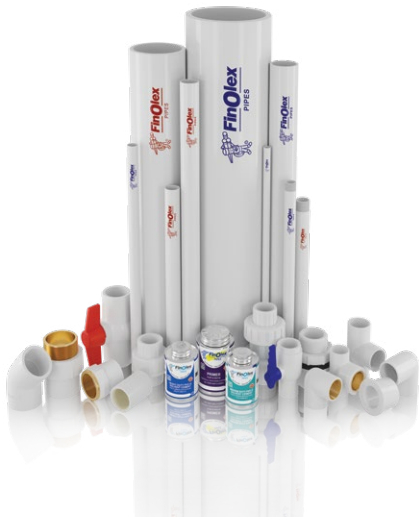
▶ ASTM Pipes and Fittings