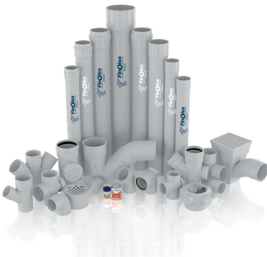
▶ SWR Pipes and Fittings