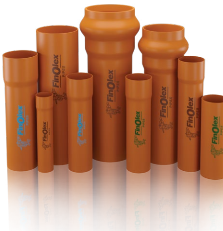
▶ Sewerage Pipes