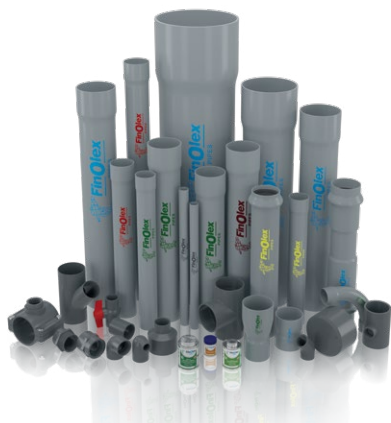
► Agricultural PVC-U Pipes and Fittings