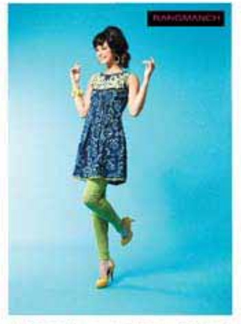
A flangmanch, is a colorful, ethnic and contempolary Indian brand that afters kurtas and churidars with classic cuts that have clean, simple lines. This brand is for women only.