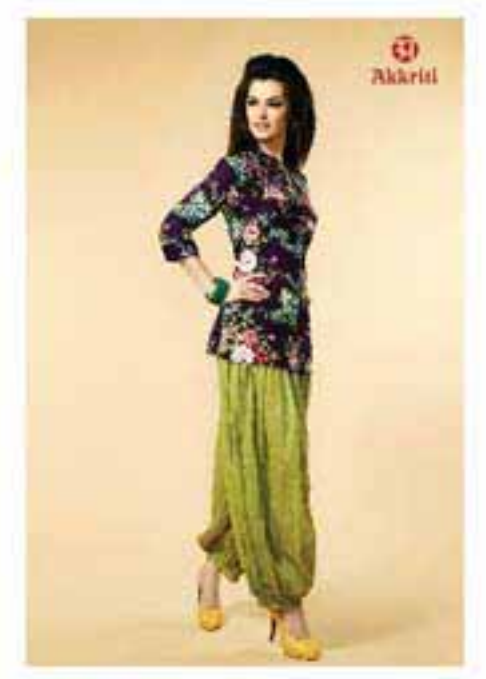
A Akkritt is a range to: both men and women who like bendy ethnic Indian weal. From unique Indowestein silhduettes for women to dhati pants for the millerinum man, there is something for any accasion.