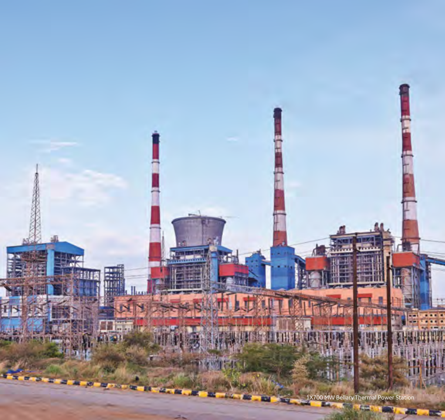
1X700 MW Bellary Thermal Power Station