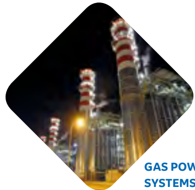
GAS POWER SYSTEMS