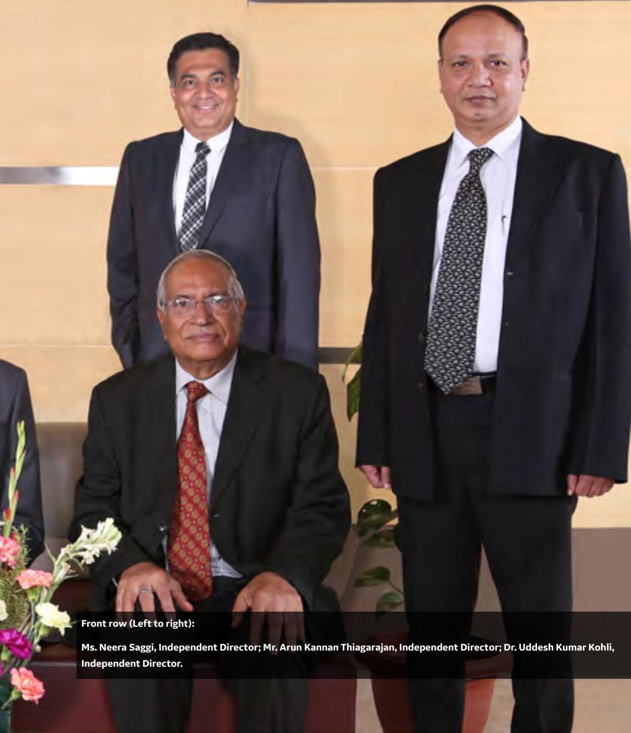
Front row (Left to right):