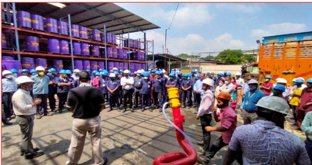
Safety First - State of the art fire hydrant system installed at plant.