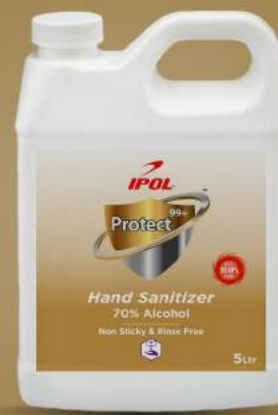
IPOL Protect 99+ Hand Sanitizer