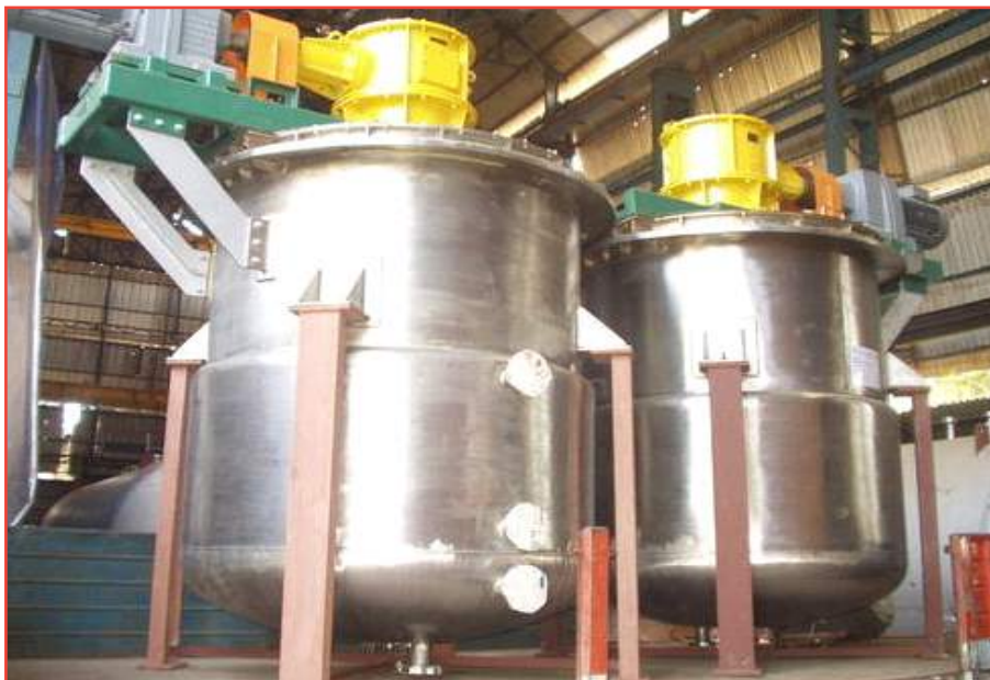
Grease capacity enhanced with addition of new kettles enabling launch of new grease categories.