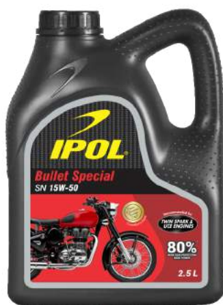
IPOL Bullet Special 15W50 SN

New contemporary packaging launch for premium grades.