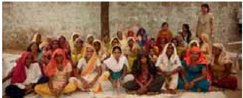
Vocational training activity in progress by SNS Foundation

The Group also runs an educational institution - the 'Himachal Primary School', a hostel for working women and a dispensary for the residents of Parwanoo. Employee participation in the Foundation's activities is integral to the volunteering spirit promoted by the Group.