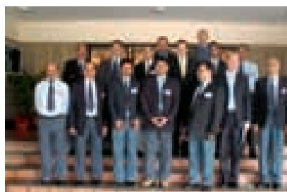
Senior management team from Volkswagen visits Gabriel, Chakan