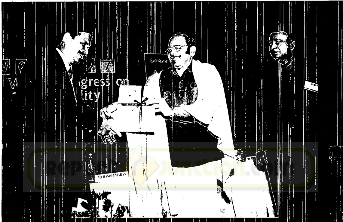
Golden Peacock National Quality Award for Gabriel India's Nasik Plant

The Shock Absorber plant located at Dewas in Madhya Pradesh has also been designed with state-of-the-art technology. Started with an initial capacity of 1.5 million units per annum, the plant today manufactures 2 million hydraulic and gas-pressurized shock absorbers for passenger and commercial vehicles. To ensure JIT supplies to its customers, Gabriel India has, during the year, installed a heavy duty generator for uninterrupted manufacturing operations. In keeping with the Company's policy of inducting 30 percent women, a new 'all women' Production Cell has also been added. In addition, some changes such as introducing new colours for machines have been carried out to provide a good work environment to the people.