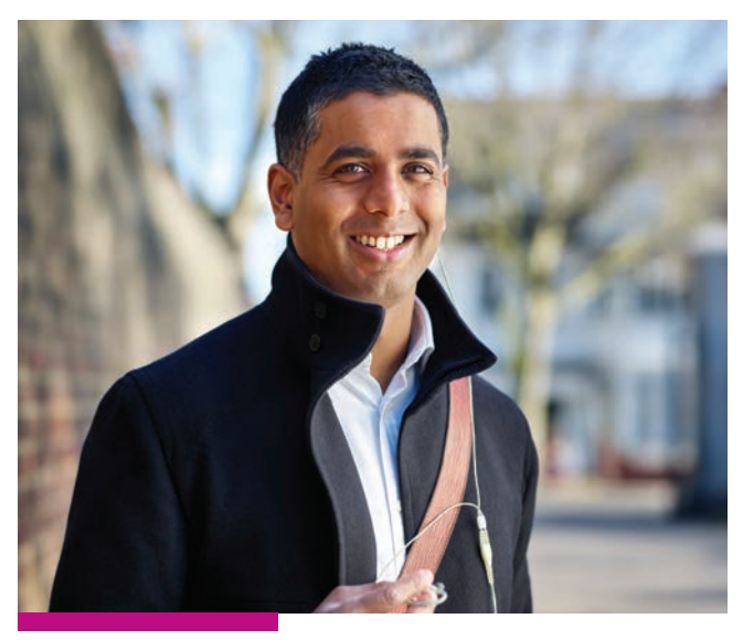
What we do

We are a science-led global healthcare company with a special purpose.