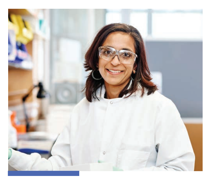
Who we are

We are a science-led global healthcare company with a special purpose.