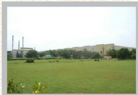
Himmatnagar Cotton Yarn (Gujarat)