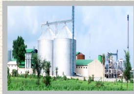
Mandsaur (Madhya Pradesh)