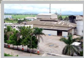
Pithampur (Madhya Pradesh)