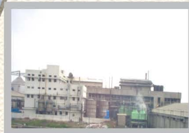
Himmatnagar Biochem (Gujarat)