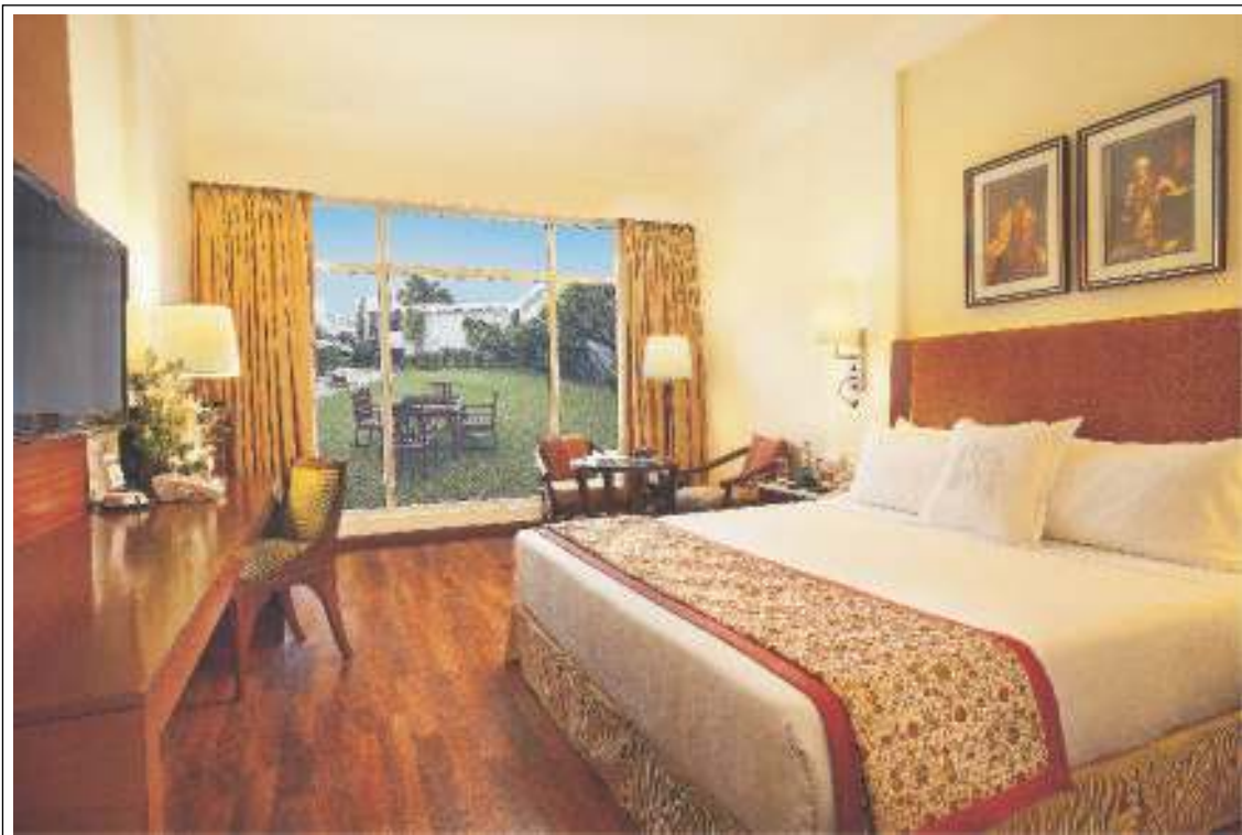
Executive Club Exclusive room