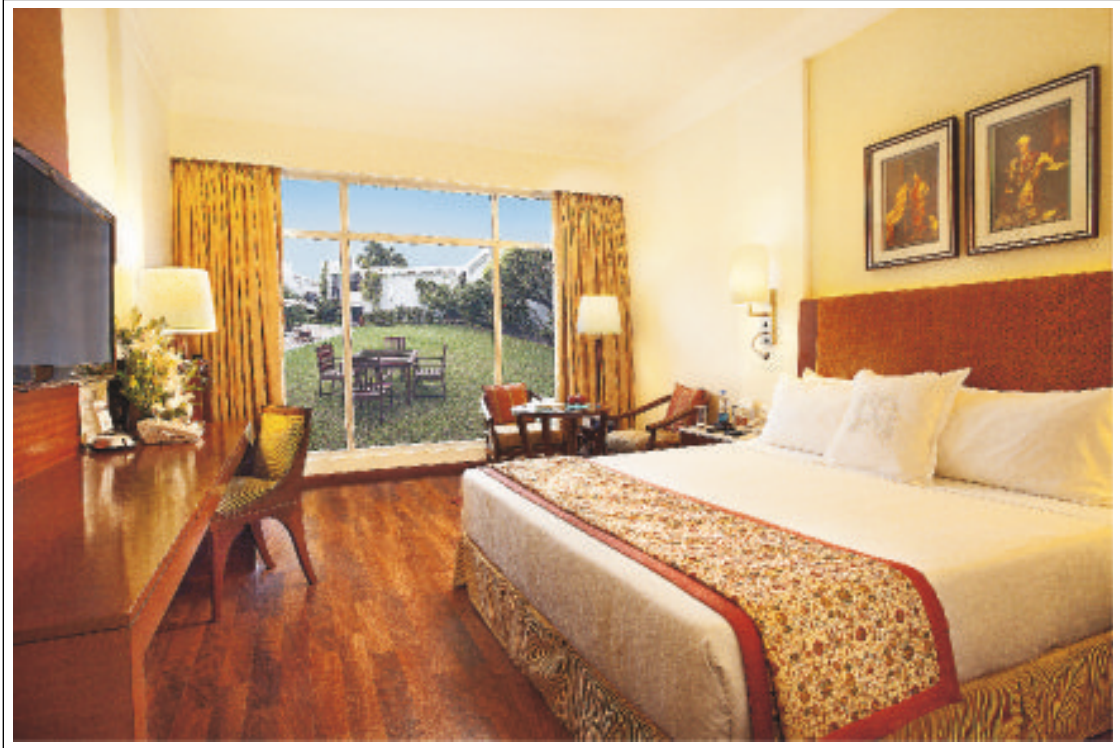
Executive Club Exclusive room