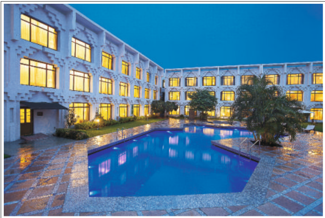
Pool Side View