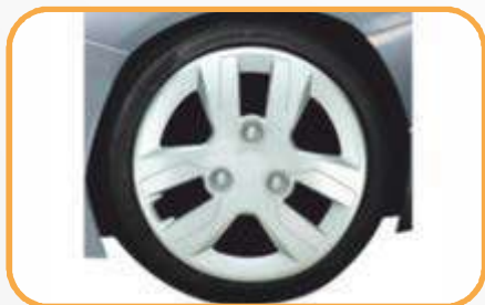
Wheel Cap of Automotive