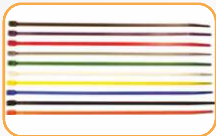
Cable Tie for Electrical/Power/Consumer Durable Segment

Some of the recently developed compounds for premium applications: