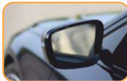
ORVM Actuator Motor Base of Automotive