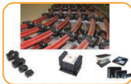
Electrical/Power/Automotive Application for Flame Retardancy