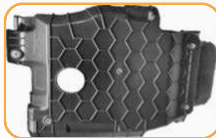
Oil Sump Cover of Automotive