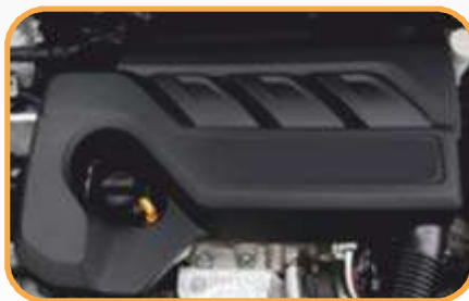
Engine Cover of Automotive