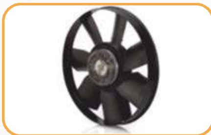
Visco Fan of Automotive