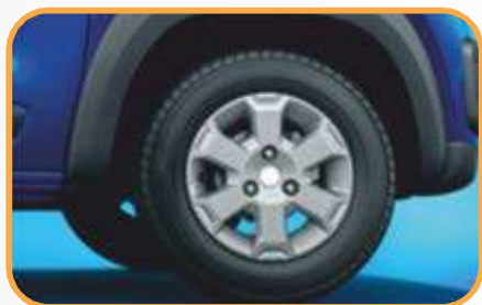
Wheel Cap of Automotive