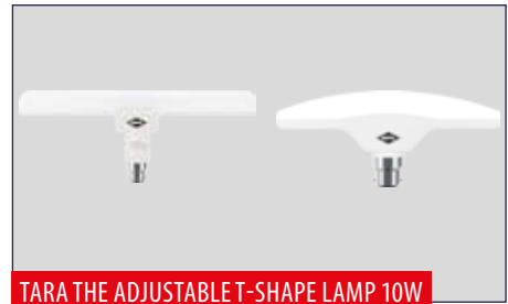
TARA THE ADJUSTABLE T-SHAPE LAMP 10W