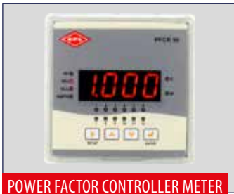
POWER FACTOR CONTROLLER METER