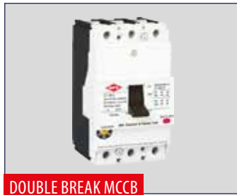
DOUBLE BREAK MCCB