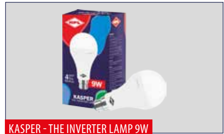
KASPER - THE INVERTER LAMP 9W