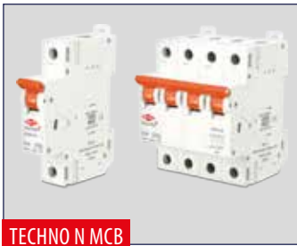
TECHNO N MCB