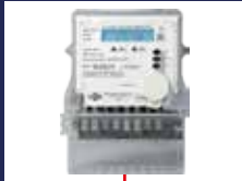
Net Meter for Solar Roof Top