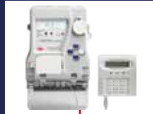
Prepaid Metering Solutions