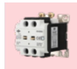
SOLIDE AC Contractor 2NC