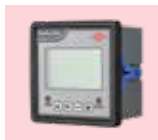
Emfis Digital Multi- function Meter