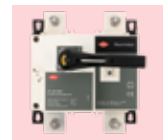
Switch Disconnector (DC LBS 400A)