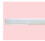
Sunlight Fly LED Batten