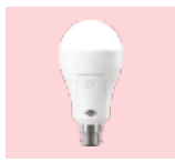
Kasper Gold Plus