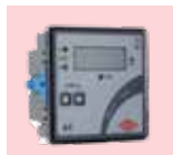
Ebrit Digital Panel Meter