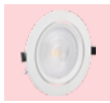
Eternal LED COB Downlighter