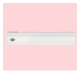
Kasper The Inverter Batten