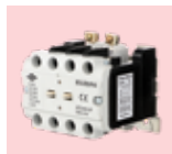
SOLIDE AC Contractor 1NO+1NC