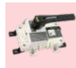
Switch Disconnector (DC LBS 250A)