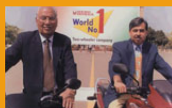
Hero Honda becomes the world no. 1 two wheeler manufacturer