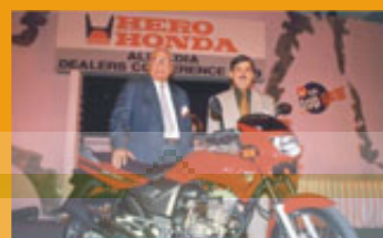
Hero Honda CBZ launched – First 150 cc motorcycle in the Indian two wheeler industry