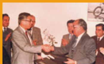
Hero and Honda sign joint collaboration agreement