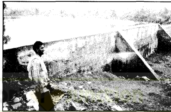
Water Project-II sponsored by HTW

Recharge impact will benefit two more downstream villages.