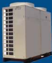
Set Free System