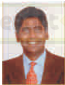
7. Mr. Vijay Amritraj