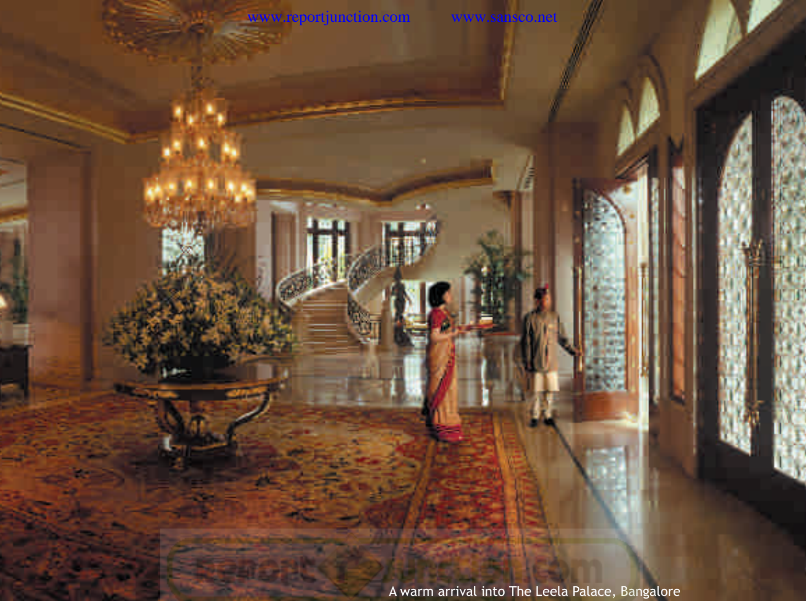
A warm arrival into The Leela Palace, Bangalore