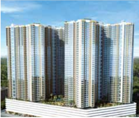
WHISPERING TOWERS, MULUND