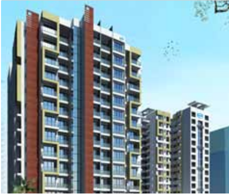
PREMIER EXOTICA, KURLA