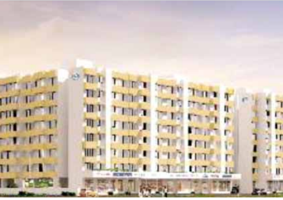
RESIDENCY PARK, VIRAR