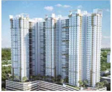
MAJESTIC TOWERS, NAHUR