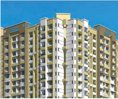
GALAXY TOWERS, KURLA