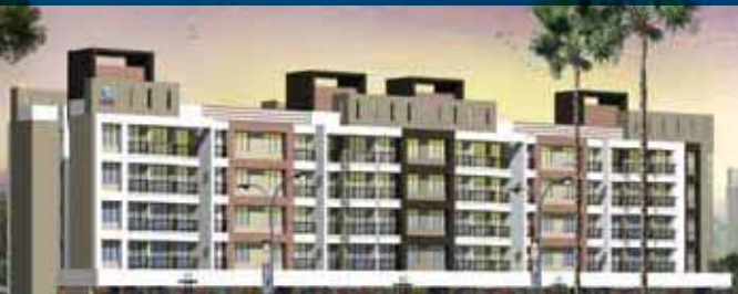
PARADISE CITY - PHASE I, PALGHAR