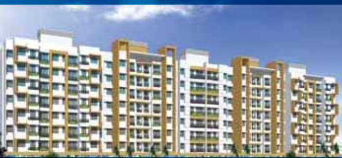
RESIDENTIAL PARK, VIRAR

Response to both, our residential and industrial parks, have been very encouraging.