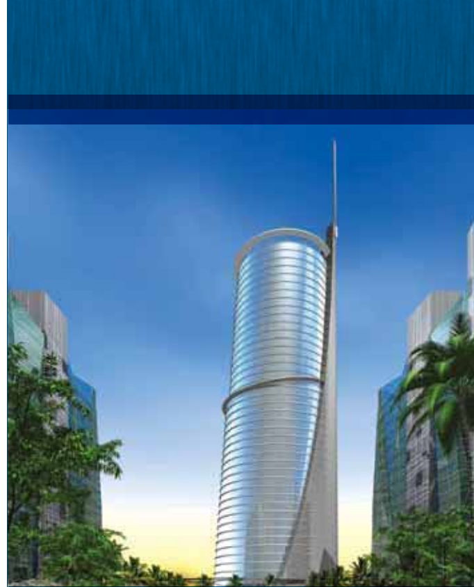
CYBER CITY, KOCHI