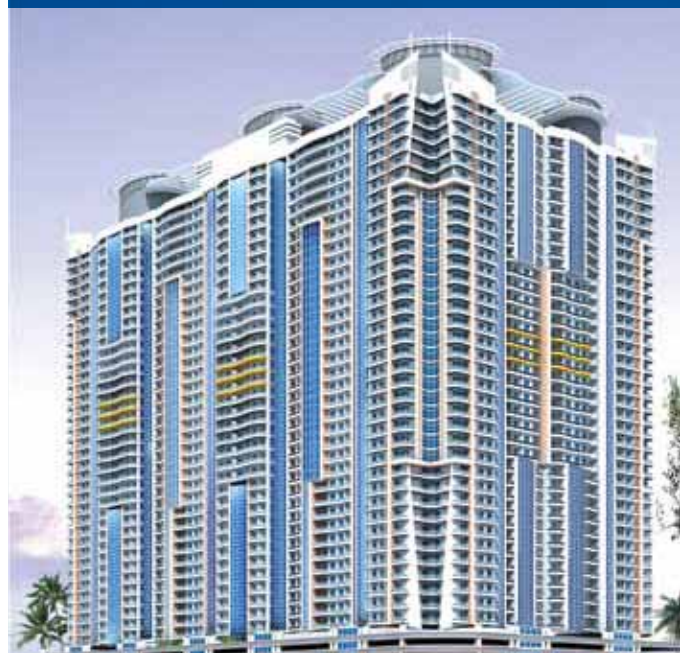
MAJESTIC TOWER, NAHUR

Our projects at Andheri, Goregaon, Kurla, Virar Nahur and Mulund were excellently received. Confirming our status as Mumbai's leading developer.