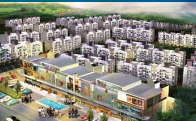
PARADISE CITY , PALGHAR