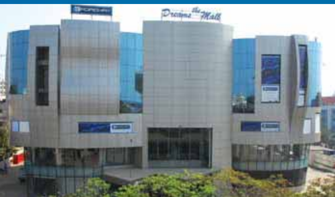
DREAMS MALL, BHANDUP