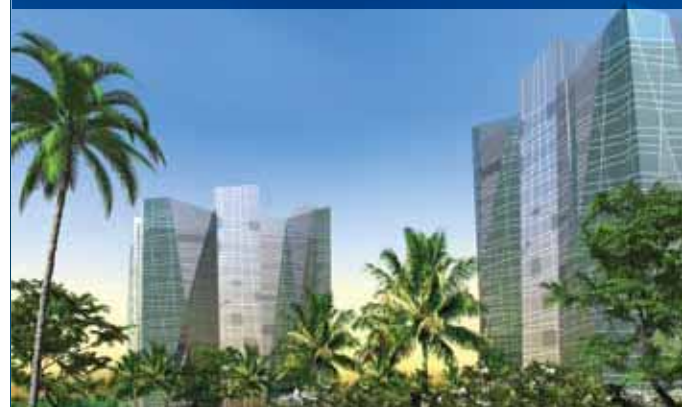
CYBER CITY, KOCHI