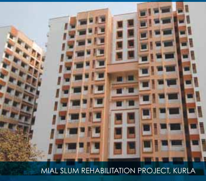
MIAL SLUM REHABILITATION PROJECT, KURLA

Already by 2012, it is estimated that 30,000 occupants of the erstwhile slums on airport land, will be relocated in the properties we have newly constructed. It's a social outreach as well, as vast swathes of hitherto lesser privileged families will now have access to infrastructure that will infinitely improve their quality of life.