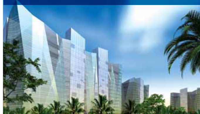
CYBER CITY, KOCHI