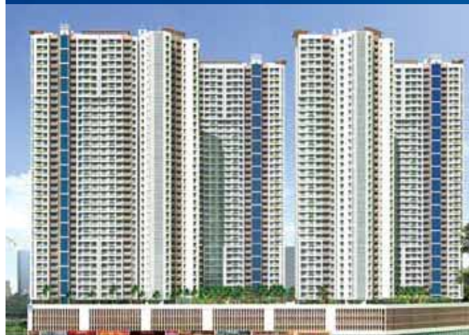
WHISPERING TOWERS, MULUND