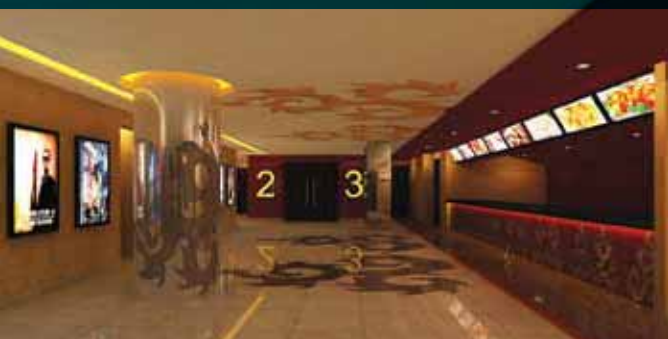
KULRAJ BROADWAY, KOLKATA