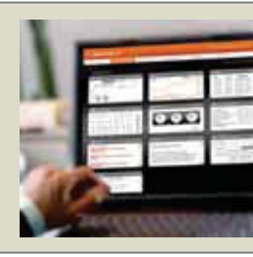
Bank App on Facebook