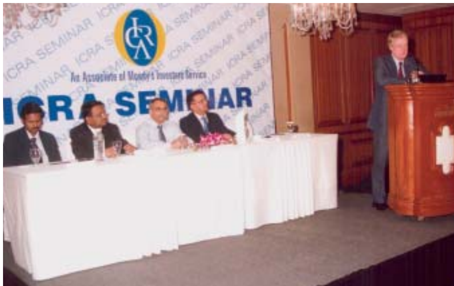
A Seminar on Basel II organised by ICRA in Mumbai on February 6, 2008