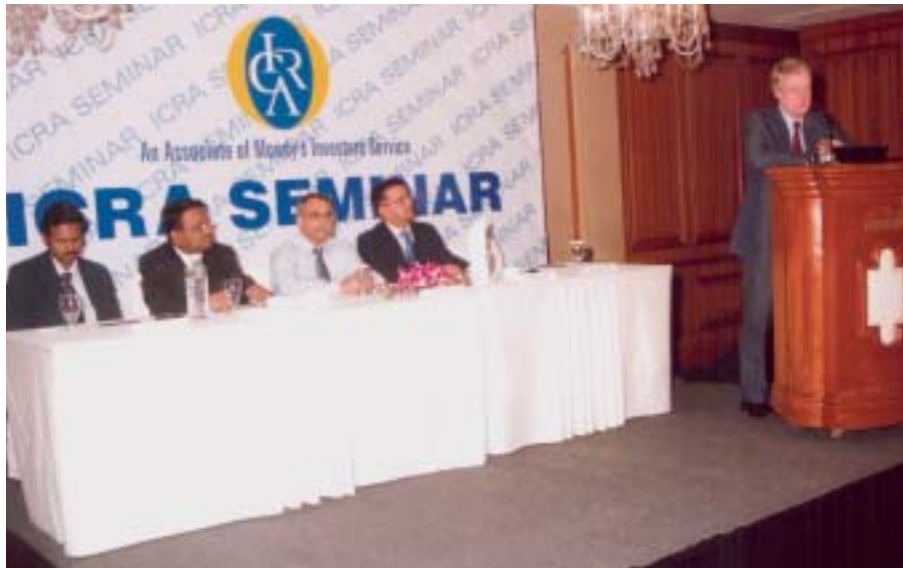
A Seminar on Basel II organised by ICRA in Mumbai on February 6, 2008