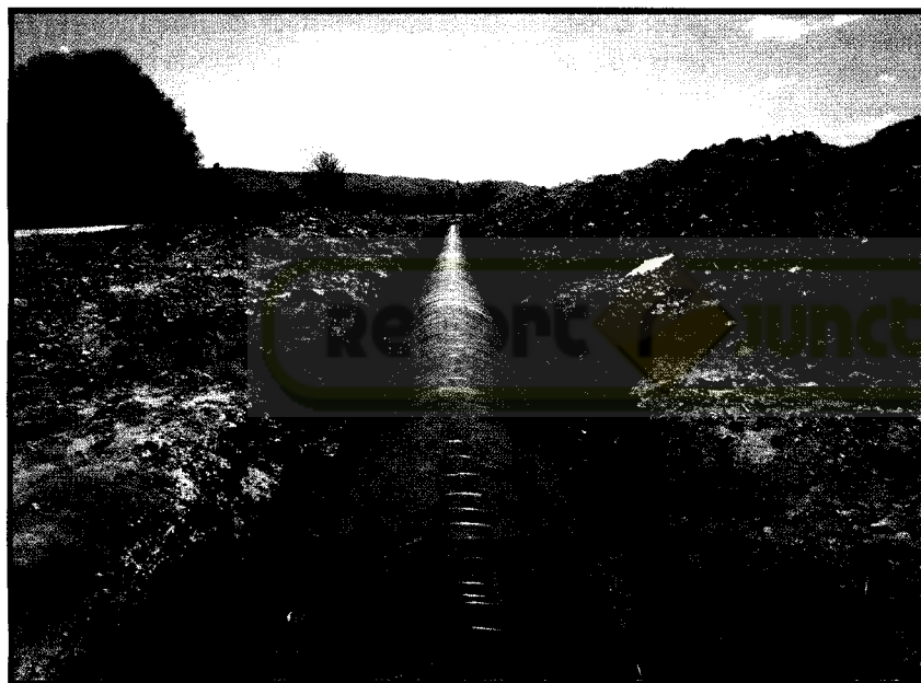
1500 MM dia M.S. Pipe line with internal mortar lining and external cold tape cooling at DABARDUMBA, against safety major work at Rajasthan.