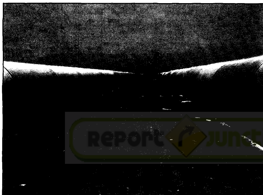
2200 MM dia M.S. Pipe line at BUND portion against Gutpa lift irrigation scheme, Nizamabad, Andhra Pradesh.

During the year 2005-06 the Company has received the order for providing, lowering, laying and jointing of 1000 mm and 900 mm dia Prestressed Concrete Cylinder Pipes (PCCP) and 800 mm dia BWSC pipes of the value of Rs.559.38 Lacs for Augmentation to Malegaon Water Supply Scheme from Maharashtra Jeevan Pradhikaran, Nasik which is progressing well and so far the Company has completed 39% of the total work.