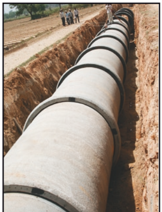
Nigam, Ghaziabad for supply, laying, jointing, testing & commissioning 2000 mm dia PSC pipes 18 KM from Upper Ganga Canal for Noida to THA Ghaziabad of the value of Rs.5,443.28 Lacs.

11. From The Superintending Engineer (XVIII) Circle, U.P. Jal