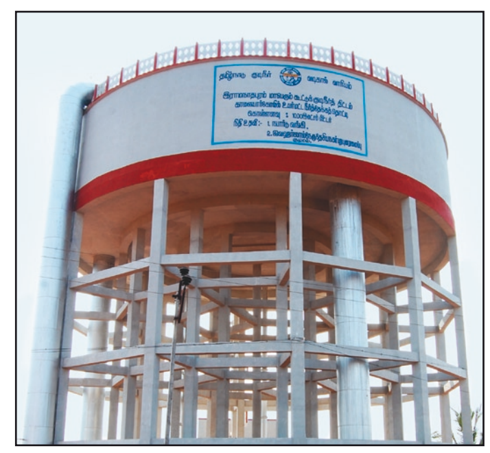
10 Lacs litre capacity overhead tank for Water supply scheme for Ramanathapuram, Sivagangai and Pudukkottai Districts

From Superintending Engineer, Public Health Circle, Anantpur for Anantpur Water Supply Improvement Scheme with PABR as source under UIDSSMT Scheme - Construction of Intake well cum Pump house with Foot bridge, Clear Water sump, Pump House, Watchman quarters, Compound wall, ELSR's