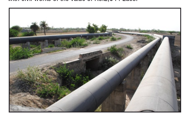
Ajmer Water Supply Scheme involving MS pipe line in Raiasthan State