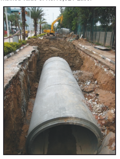
2400 mm dia RCC NP3 class pipe for Bangalore water supply and Sewerage Board Bangalore.