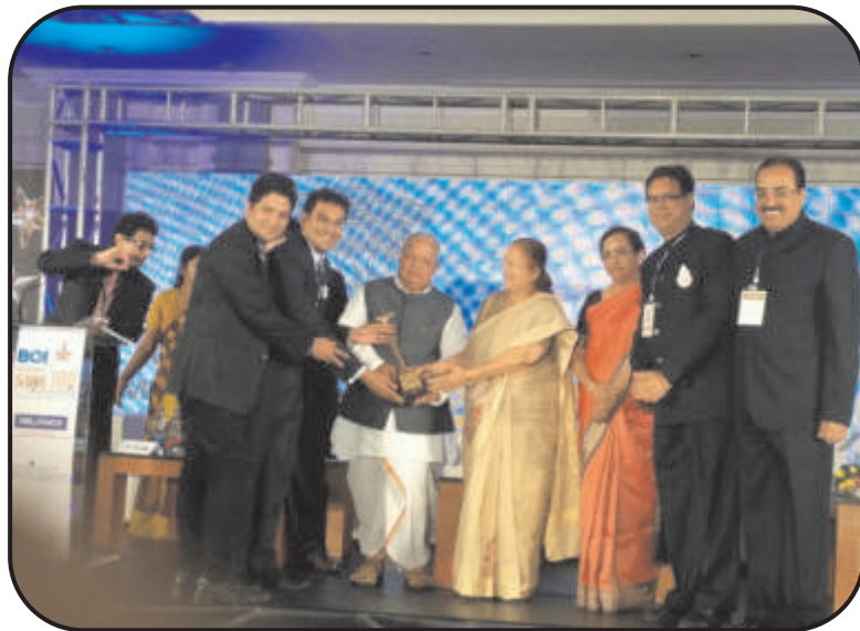
ITL emerged as a Winner of the “Top 100 SME’s of INDIA” Award Presented by Hon’ble Speaker of L.S. Mrs. Sumitra Mahajan and Hon’ble Union Cabinet Minister of MSME Mr. Kalraj Mishra