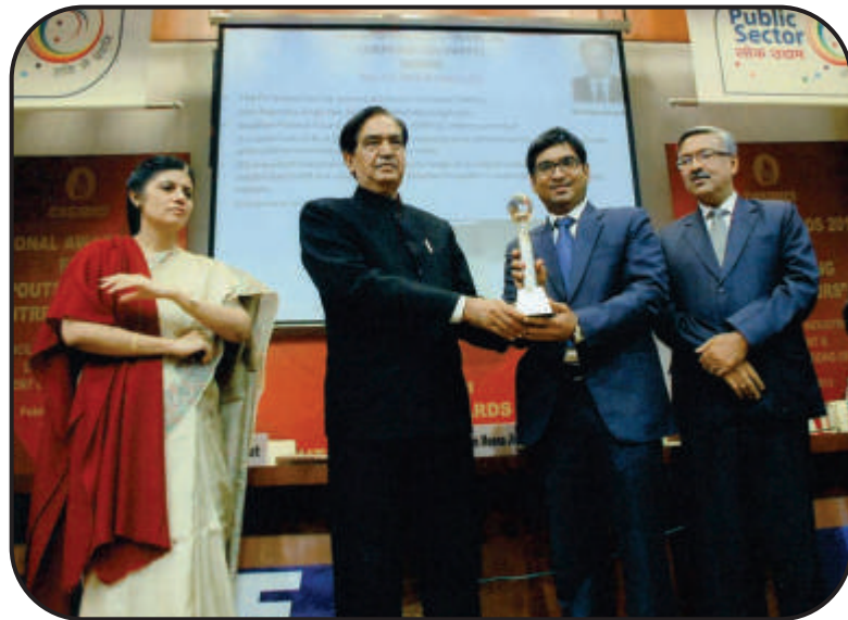
COSIDICI National Award of Outstanding Entrepreneur by State Minister Finance Namo Narain Meena