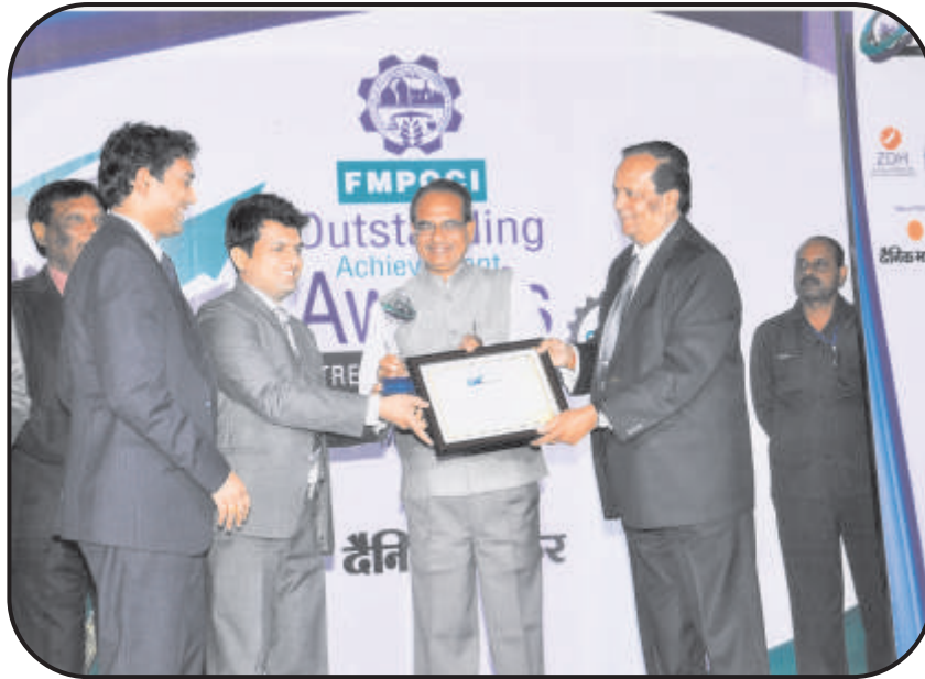
Award for outstanding Achievement as “Import Substitute Provider” in SSI Category, by M.P. Chambers of Commerce in Presence of Hon. CM Mr. Shivraj Singh Chouhan