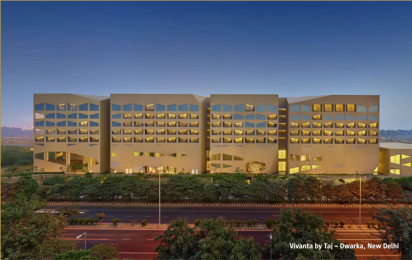
Vivanta by Taj – Dwarka, New Delhi