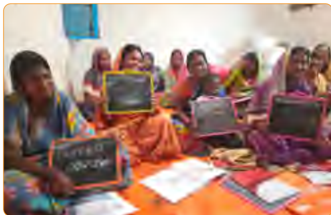
CLC Asa Aame Patha Padhiba

Our Community Learning Centres (CLC) are one the most impactful initiative, "Asa Aame Patha Padhiba" written on their slates, reflects their joy.