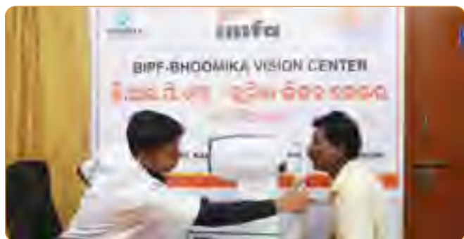
Project Arogyadhara Vision Care

In India, as many as 550 million people are estimated to be suffering from vision problems due to lack of proper awareness and availability of services. BIPF's partnership with Bhoomika Eye Hospital and LVPEI Vision Care Center is an opportunity to care for the wellbeing of the community we serve by providing essential eye care and thus help them prevent vision issues in the future. BIPF Bhoomika Vision Centre "BBVC" was inaugurated on 17 th August 2022 at Sukinda (SMC-IMFA) and LVPEI Vision Care Centre established in 2017 at Therubali, provided requisite care to patients through free vision correction test, subsidised eye-glasses and treatment in the tertiary care unit. Total 3,178 people have availed vision care in the FY 2022-23.