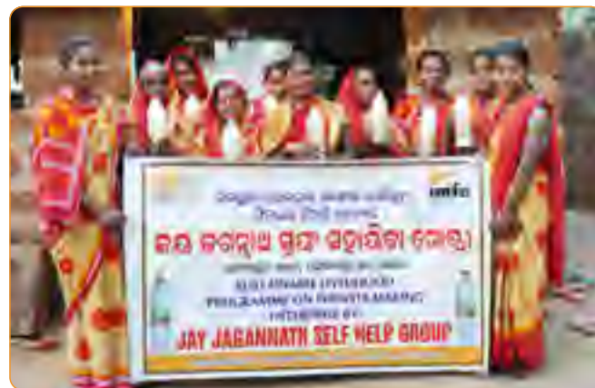
Project Unnati Phenyl Enterprise IGA

Project UNNATI is an integrated capacity building initiative designed in-line with the self-help approach for socio-economic empowerment of rural women in Odisha. Through vocational, skill development and micro finance opportunities, we have ably created a woman-driven ecosystem, which understands the need for savings, credits, livelihood and financial literacy. This has made them an important household contributor and decision-maker. The self-help groups (SHGs) are linked with banks and government departments to receive financial assistance, training and support.