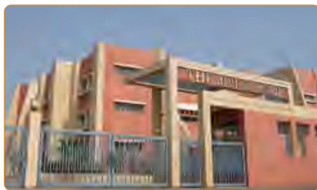
Project Adhyayan TBS – Choudwar, Cuttack

Established in 2019, spread over 5 acres, The BIPF School (TBS) is a co-ed CBSE Affiliated English Medium School from Nursery to Class X th . The school is aesthetically designed with restriction-free access for differently abled students; thus promoting academic inclusiveness in Cuttack District. TBS provides student centric learning environment that balances academic excellence, extra-curricular activities and value based approach to character building. TBS has successfully set a benchmark in terms of quality teaching, personality grooming, on-campus facilities and safe learning environment.