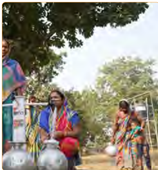
Su Swasthya Safe Drinking Water

Provision for safe drinking water has been facilitated by the installation of tube wells and upgrading water source points with purifiers & coolers at various locations in Choudwar, Sukinda & Therubali. Repair & maintenance of existing water sources also come with community participation for the sustenance of the best practices. The process benefited 6,570 community members. Additionally, drinking water also supplied through tanker during water-stress period at Sukinda.