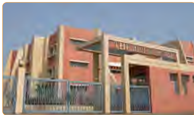
Project Adhyayan TBS – Choudwar, Cuttack

Established in 2019, spread over 5 acres, The BIPF School (TBS) is a co-ed CBSE Affiliated English Medium School from Nursery to Class X th . The school is aesthetically designed with restriction-free access for differently abled students; thus promoting academic inclusiveness in Cuttack District. TBS provides student centric learning environment that balances academic excellence, extra-curricular activities and value based approach to character building. TBS has successfully set a benchmark in terms of quality teaching, personality grooming, on-campus facilities and safe learning environment.