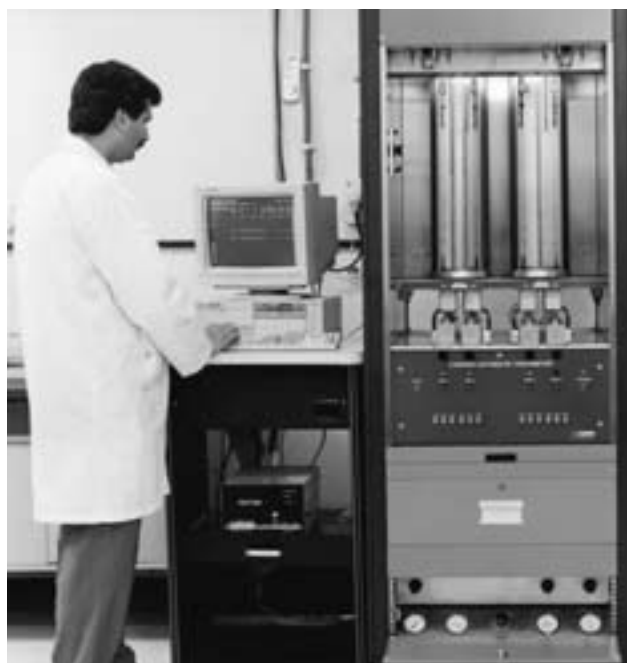
IndianOil R&D Centre, Faridabad