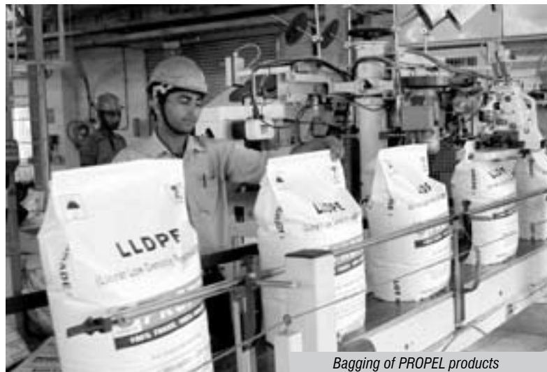
Bagging of PROPEL products

The recent breakthroughs in the global E&P sector are expected to boost the Corporation's aspirations in the E&P space. The Corporation has been aggressively scouting for suitable investment opportunities.