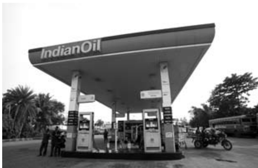
IndianOil Retail Outlet, Diu

operational efficiency and cost optimization. Some steps such as the commissioning of Integrated Crude Oil Handling Facilities at Paradip were taken during the year. This facility has enabled the Corporation to receive the entire crude oil requirement of Barauni, Haldia, Bongaingaon Refineries and the upcoming Paradip Refinery through Very Large Crude Carriers (VLCCs) and thereby reduce the supply chain input costs. An important lever in the pursuit of cost optimization is achieving reduction in cost of sourcing crude oil, the single largest component of cost. The Corporation has strategized to source and process cheaper and opportunity crude oil varieties. The endeavours so far have resulted in processing 53.3 percent of high sulphur crude oil in 2012-13 compared to 49.2 percent in 2011-12, as also enlargement of the crude oil basket to include high TAN and heavy crudes with API as low as 21°. Presently, the share of opportunity crudes (Heavy & High TAN) is about 13 percent and includes processing of Maya crude and heavy Rajasthan crude. This is targeted to be doubled to over 26 percent once Paradip Refinery is operational. Further, towards achievement of this objective, besides augmenting the capability of refineries to process such crude oils, investments are also being made for augmenting the capacity of major pipelines to transport heavy crudes.