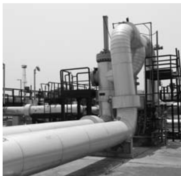
IndianOil Paradip-Haldia-Barauni Pipeline

The investment programme of the Corporation during the XII Plan period, captures some of these opportunities and envisages to undertake projects worth over ₹ 56,000 crore across the energy value chain. The currently under implementation 15 MMTPA refinery in Paradip has reached an advanced stage of completion. In addition, a number of other major projects such as Paradip-Raipur-Ranchi product pipeline, augmentation of Paradip-Haldia-Barauni pipeline, Paradip-Haldia-Durgapur pipeline, new marketing terminal at Paradip, LPG facilities at Paradip, debottlenecking of Salaya-Mathura Pipeline and FCC revamp at Mathura are at various stages of implementation.