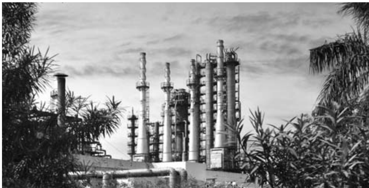
IndianOil Refinery, Koyali

The Corporation continues to be influenced by a host of external factors ranging from global economic and geo-political upheavals, inherently uncertain energy markets and closer home the uncertain compensation mechanism and interventions in the product pricing schedules. The Corporation has managed these challenges well during the year and is committed to deliver growth with sharp focus on